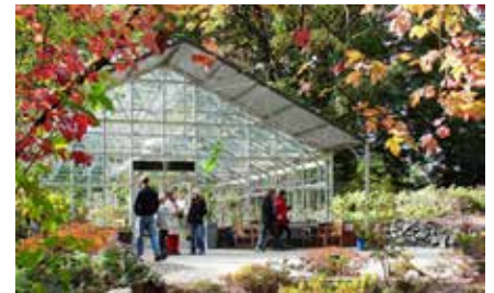
Rutherford Conservatory in the fall