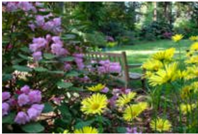
R. orbiculare overlooking meadow