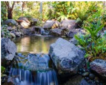
Pond in Rutherford Conservatory