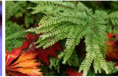
Polystichum setiferum in the fall