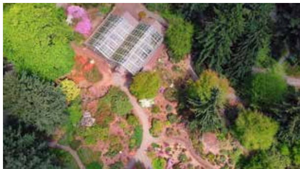
Aerial view of Rutherford Conservatory