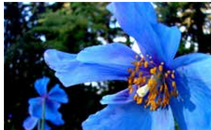
Himalayan Blue Poppy