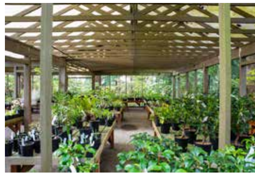
Plant Sales Nursery