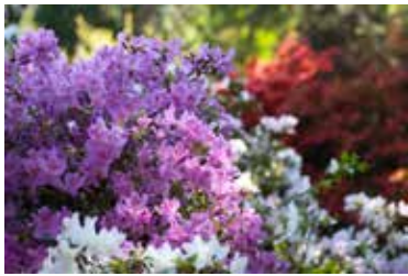
Late spring blooms

Click here to download high-resolution images, logos, and brand messaging