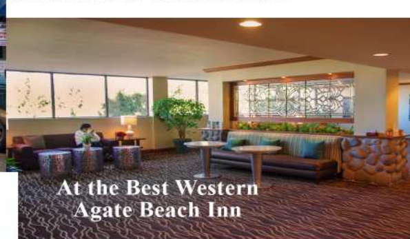
At the Best Western Agate Beach Inn

View from the Best Western Agate Beach Inn