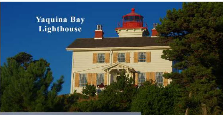
Yaquina Bay Lighthouse